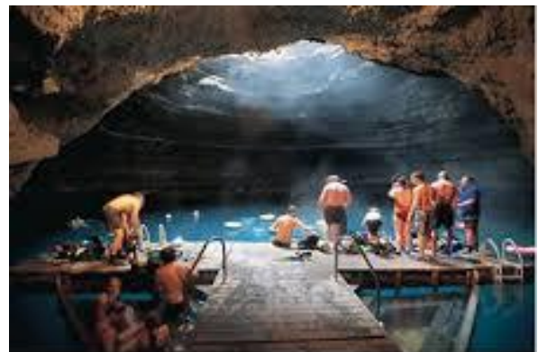
The Homestead Crater Midway, Utah Swim, Snorkel, Scuba Dive

This "Crater" is one-of-a-kind geothermal spring, hidden within a 55' tall beehive-shaped limestone rock, offers swimming, scuba diving, snorkeling and even paddle board yoga classes. The hole at the top of the dome lets in sunlight and fresh air while the interior stays heated by the mineral water at a constant range of the mid 90s for a completely unique and therapeutic soak and swim. You do not have to get wet to have a one-of-a-kind experience inside The Crater. Many guests just enjoy the self-guided tour, which covers the history, geology and archaeology of this remarkable natural phenomenon. You needn't rappel through the top of the dome to enjoy all of the fun either. A tunnel was bored through the rock wall at ground level, lending easy access to custom-built decks and a soaking area where guests