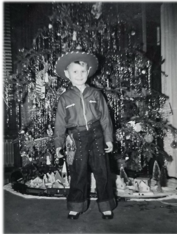
Guess who?? see page 18

With all your support and participation, we look forward to having another year of outstanding trips for the 2024 ski season.